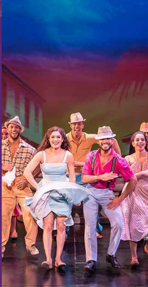
On Your Feet

Choose your seats before the tickets go on sale to the general public!