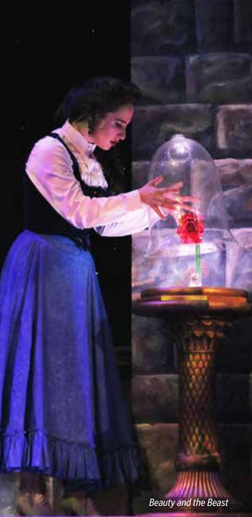
Beauty and the Beast